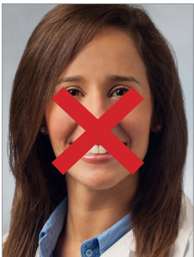
Image is cropped too tight