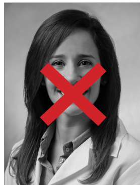
Image is black and white