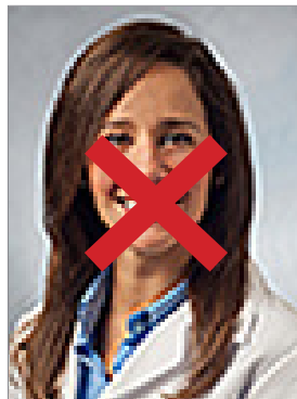
Image quality/resolution is not good