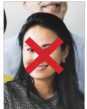
Cropped from a group photo