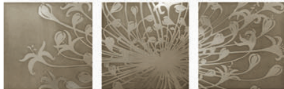
Blasted Romeo by Beth Weintraub.

“We want our patients to feel comfortable and engaged in their environment,” she continues. “And in many ways art can help to motivate and empower our patients. We want to give our patients every advantage when it comes to fighting cancer. We want to help them win.”