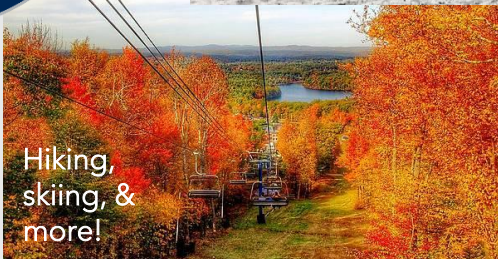
Hiking, skiing, & more!