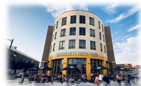
Renowned breweries & restaurants galore!